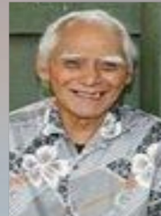
3. First Name, Surname