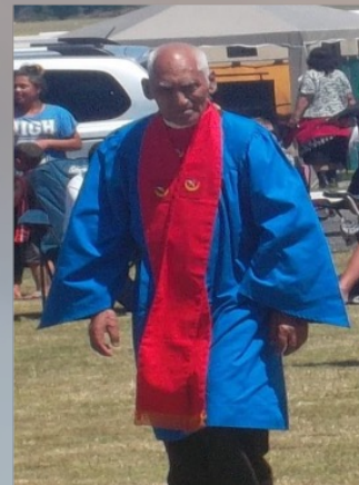
1. First Name, Surname

The Court of Appeal found in favour of Sir Graham and the Council. It stopped the privatisation of disputed property, empowered the Waitangi Tribunal to recover land if it was required to redress Treaty breaches and guaranteed proper funding of the Waitangi Tribunal.