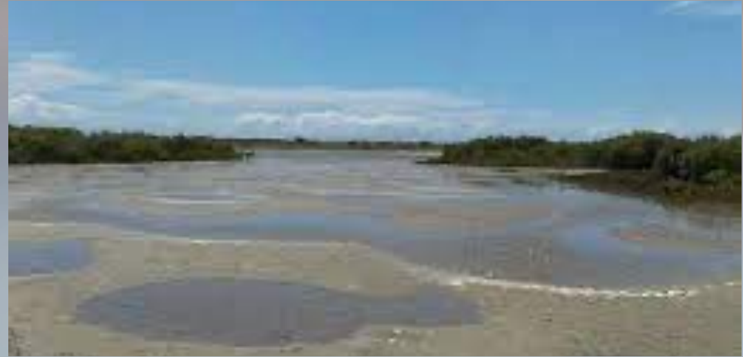
Aurere Beach Road, Taipa

Furthermore, actions permitted under these Resource Consents have led to the continued pollution of the Parapara River, Taipa Estuary, Aurere Beach, Tokerau Beach, Coopers Beach, Cable Bay, Chucks Cove, Mangonui Estuary, Oruru River and depending on the tide and currents as far as Taemaro Beach and surrounding estuaries.