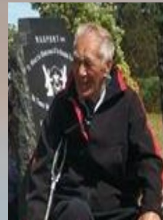
2. First Name, Surname