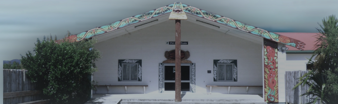
Te Paatu Marae, Pamapurua